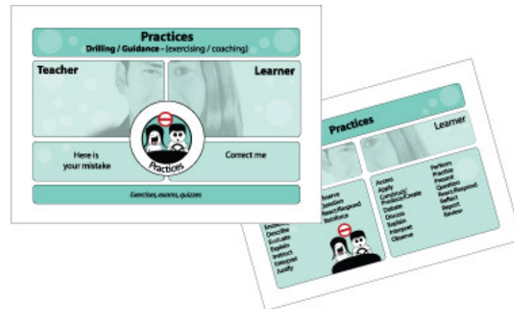
Figure 2: Event Flash Card

Flip over the flash card. For each event, describe the sequence of actions performed by both the Teacher and the Learner. Use as many or as few verbs/descriptors as you like.